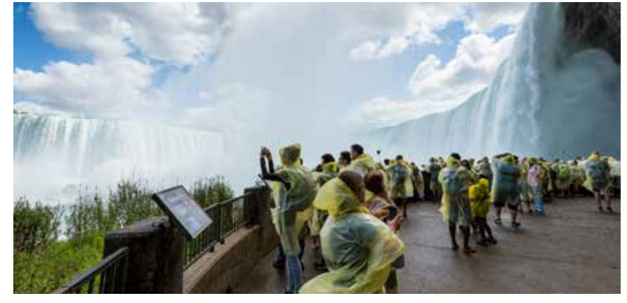
Participants are responsible for their own itinerary and associated costs while visiting Niagara Falls.

Visiting Niagara Falls Bus leaves at 1pm Bus returns to hotel TBD